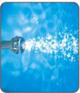
Adjustable Air Massage System